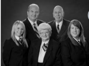
3 Generations of Morgan Family

10008 Lundy's Lane 905.358.5811 www.countrybasketniagara.com